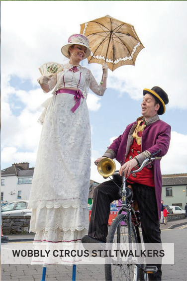
WOBBLY CIRCUS STILTWALKERS