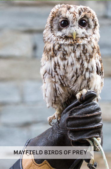
MAYFIELD BIRDS OF PREY